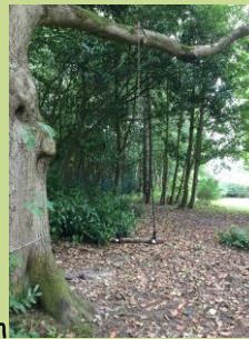
Our rope swing