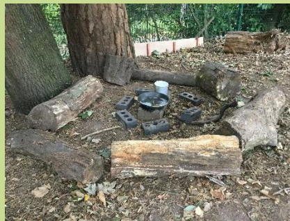
Our mud campfire