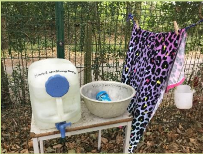
Our hand washing station