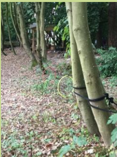
Our rope trail