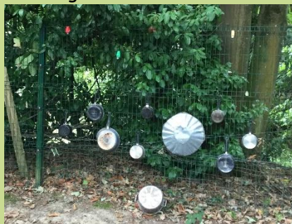
Our pan music fence