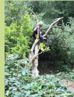
Our climbing tree